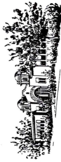
THE OLD BELMONT PUBLIC SCHOOL

TWIN PINES PARK 1225 RALSTON AVENUE BELMONT, CA 94002